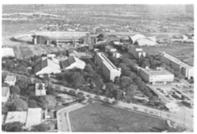
Monterrey Institute of Technology

Monterrey is situated 150 miles south of the border and can be reached via air lines operating daily schedules, and, there are also excellent highways. The city is one of Mexico's largest and most industrialized, but still retaining the charm of "Old Mexico." This is an excellent opportunity to visit Mexico and exchange ideas and experiences with Mexican colleagues of the Fat and Oil Industry. Your presence or that of your representatives will greatly contribute to the success of this first Short Course.